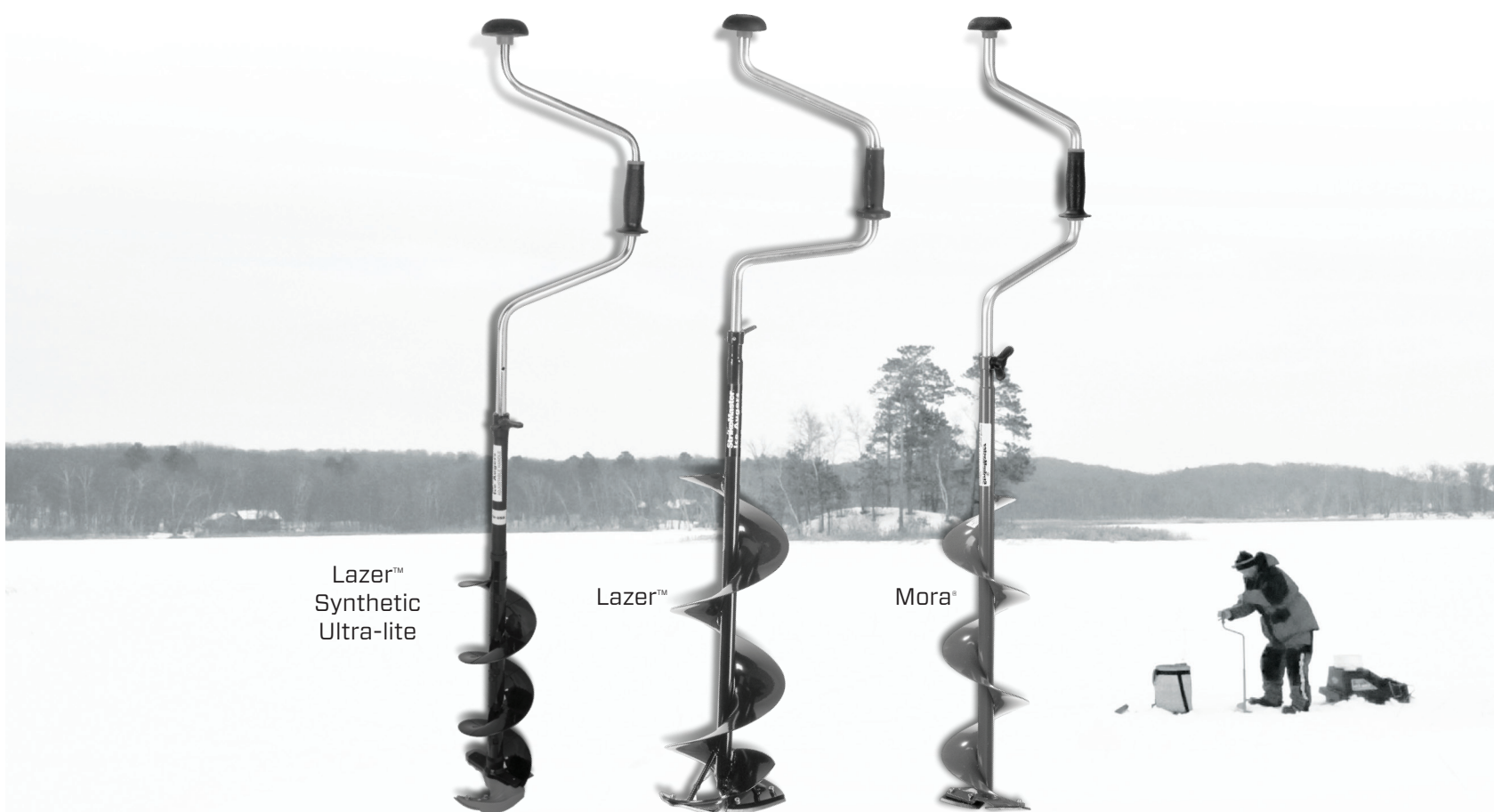
Lazer™ Synthetic Ultra-lite